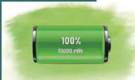
Long Standby Time